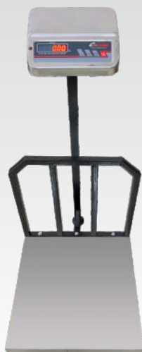
Model No.: AP Capacity: 30 kg to 5000 kg